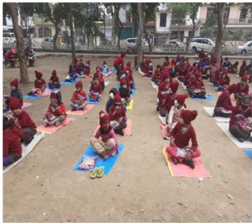
Class at one of the centre