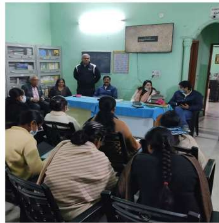
YMSLI – provided 25 tabs for digital education Training conducted for Teachers