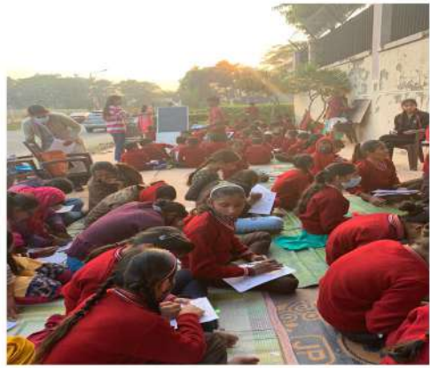
Class at one of the centre