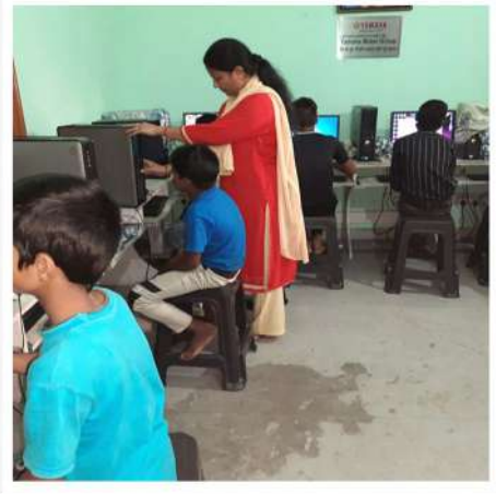
Computer Lab Setup by YMSLI