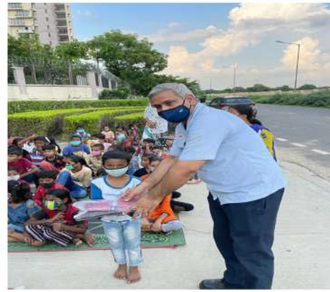
Uniform and books distribution Greater Noida Centre