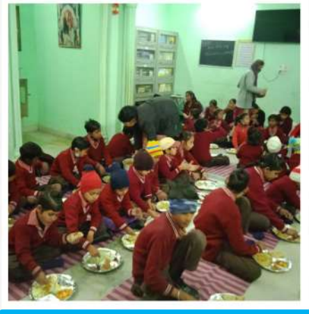
Meal is being served at one of the center