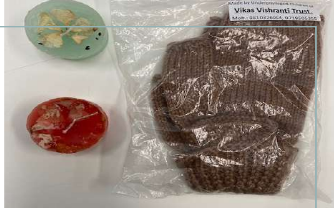
Handicraft – Candles & Gloves